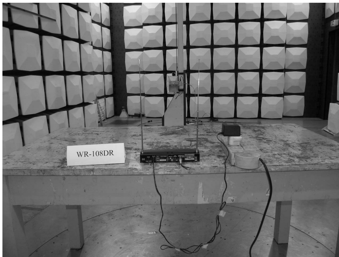
Photograph 3: Set-up for Radiation Measurement Above 1GHz