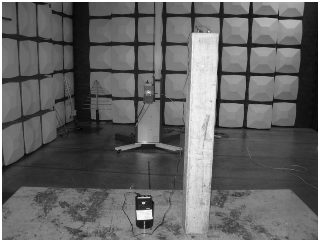
Photograph 2: Set-up for Radiation Measurement Above 1GHz