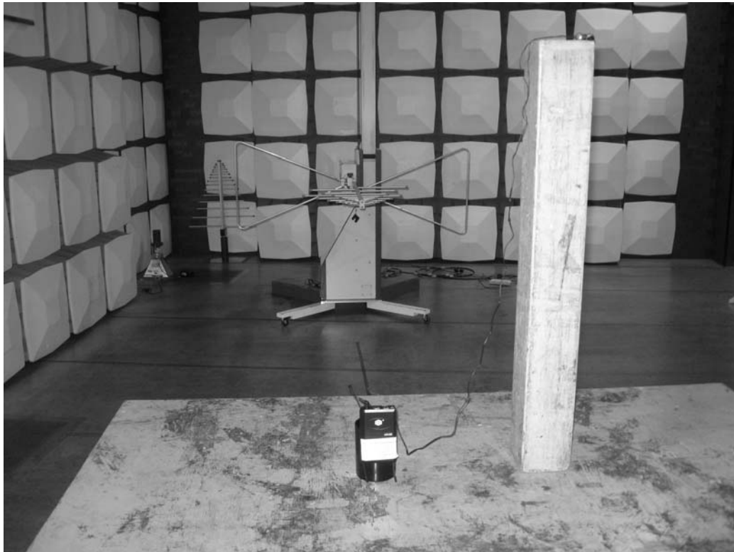
Photograph 1: Set-up for Radiation Measurement Below 1GHz