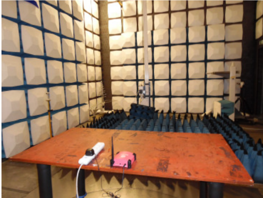
Photograph 2: Set-up for Radiation Measurement above 1GHz