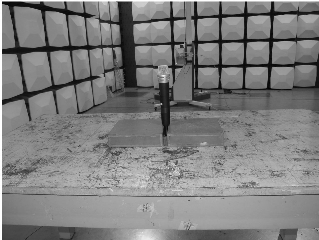
Photograph 2: Set-up for Radiation Measurement above 1GHz