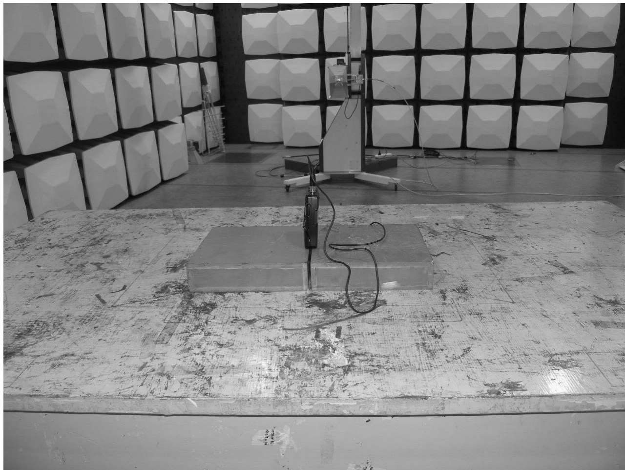
Photograph 2: Set-up for Radiation Measurement above 1GHz