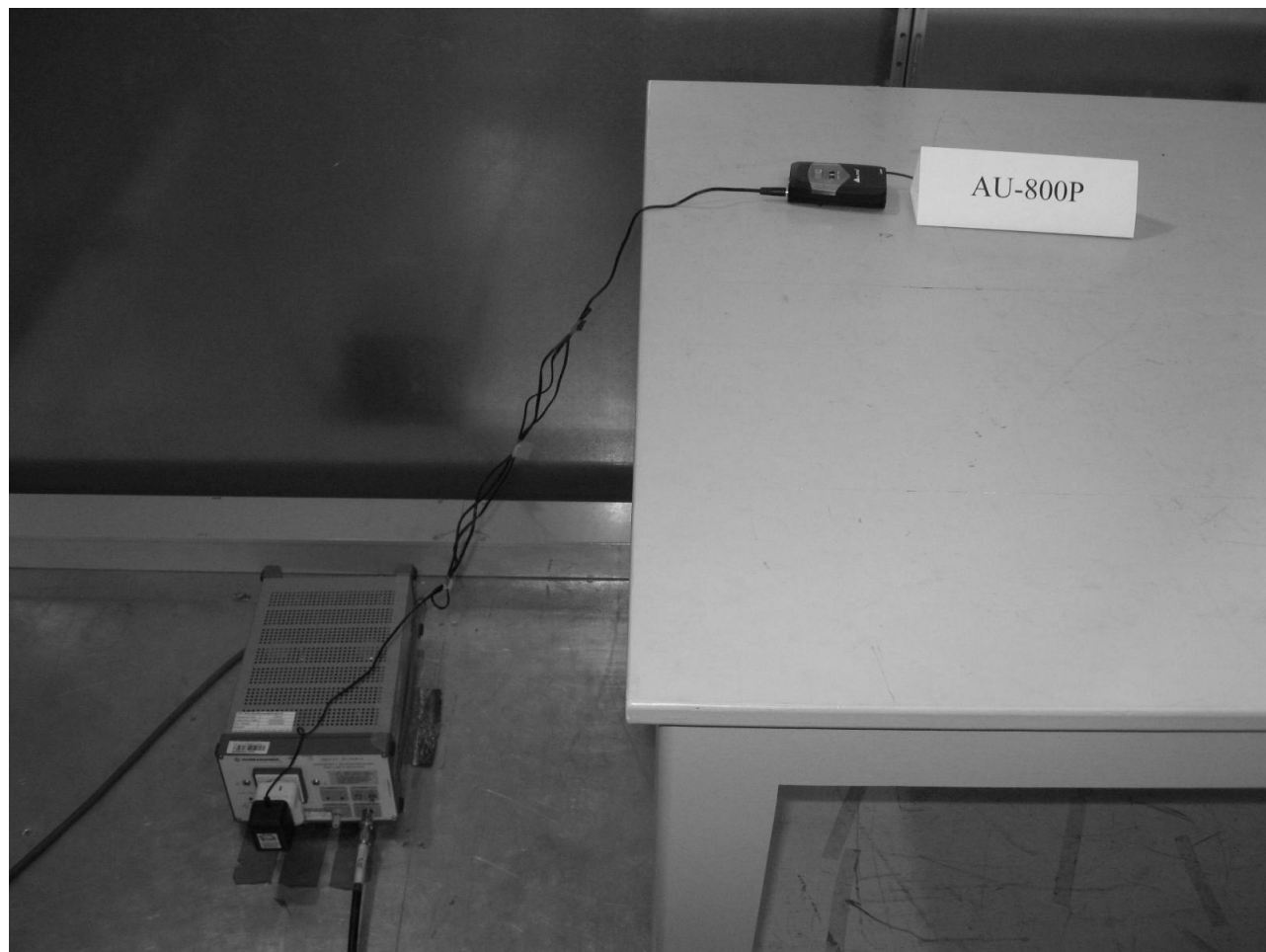
Photograph 3: Set-up for Conducted Emission of AC mains