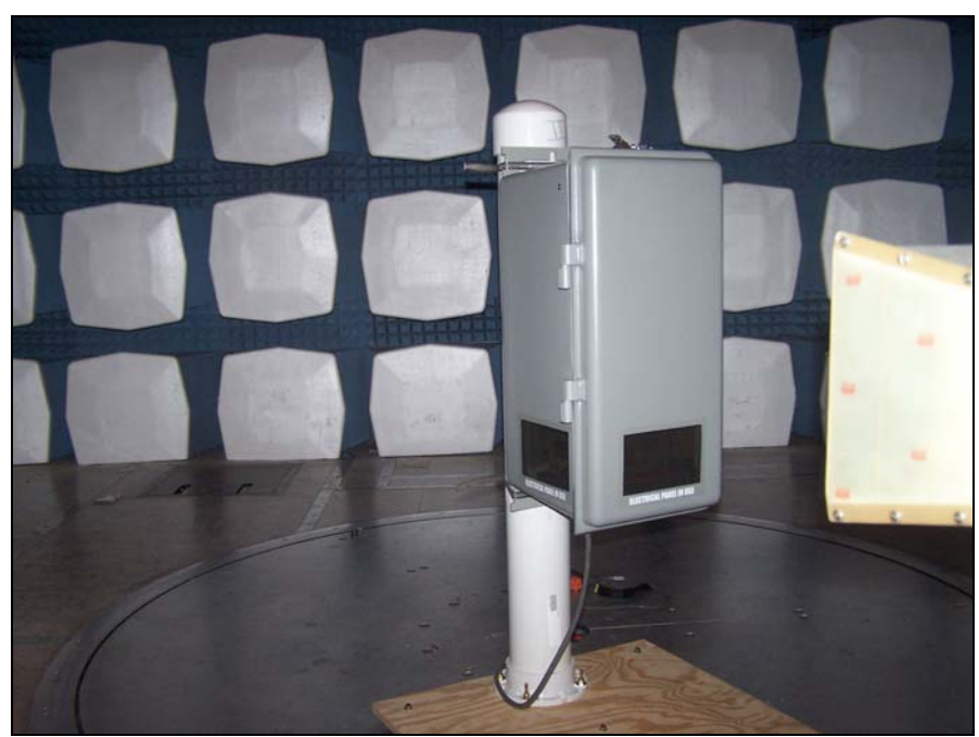
Photograph 3. Radiated Spurious Emissions Test Setup