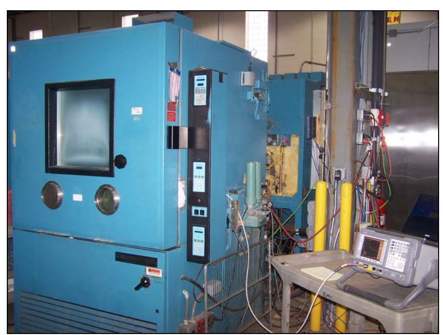
Photograph 4. Frequency Stability Test Setup