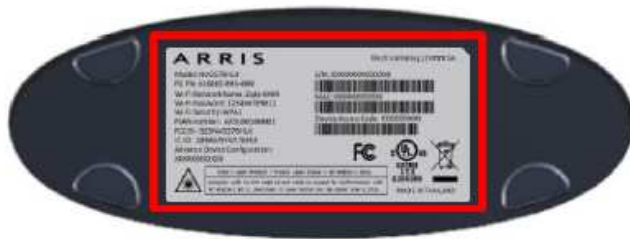
Label stick location