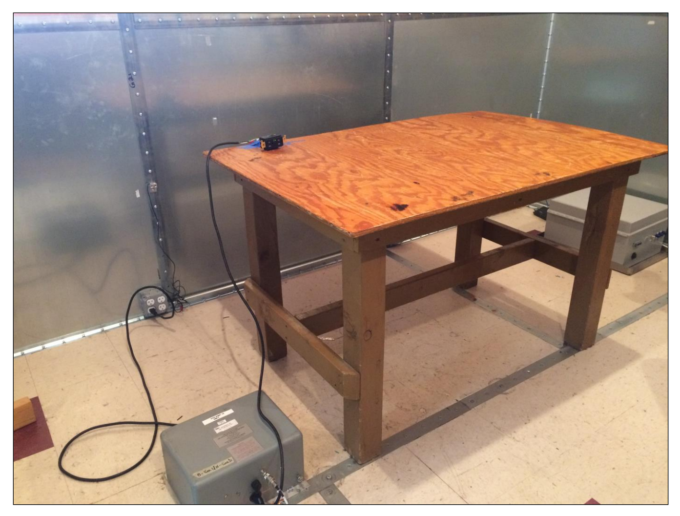
Photograph 1. Conducted Emissions, 15.207(a), Test Setup