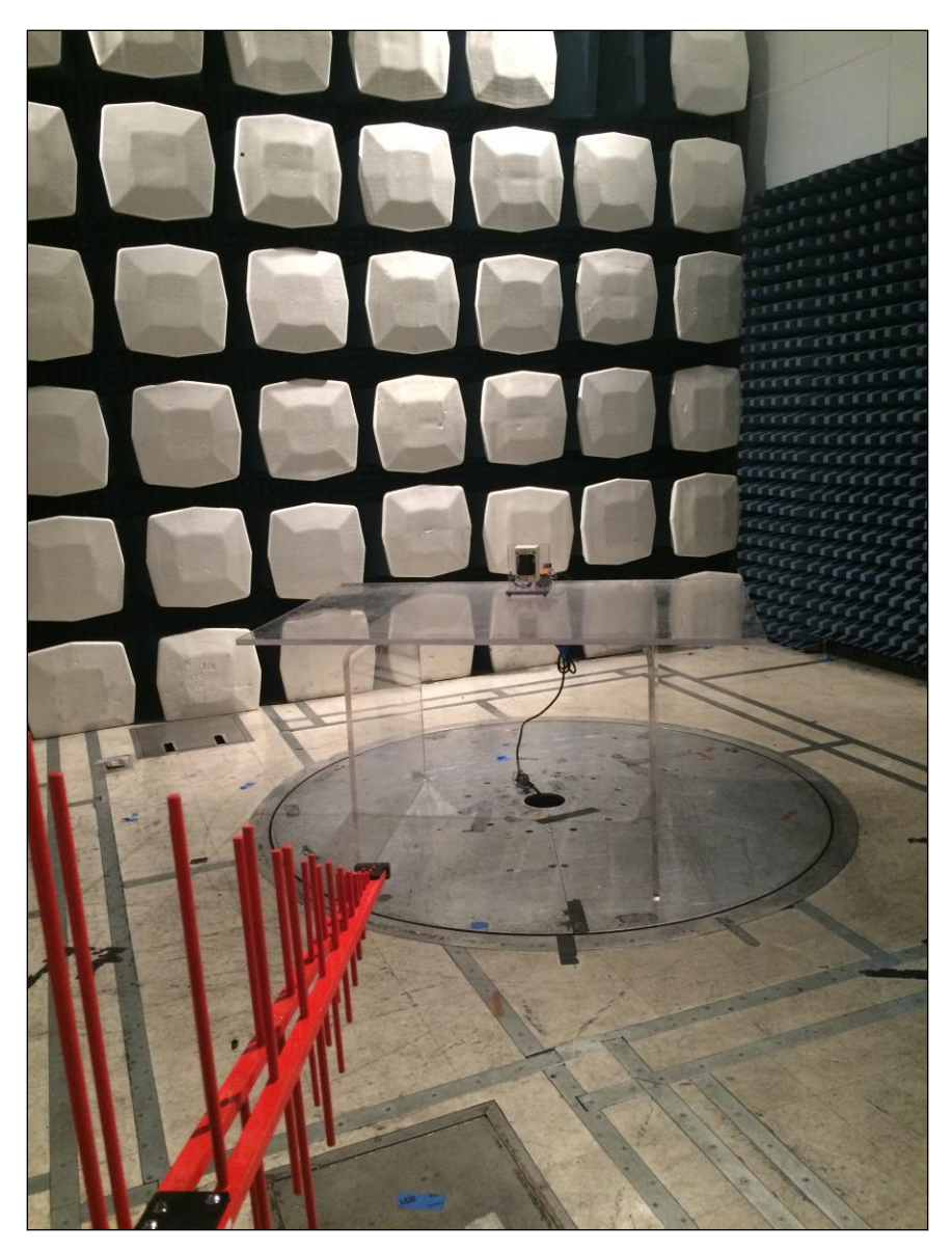
Photograph 2. Radiated Spurious Emissions, Test Setup, Below 1 GHz