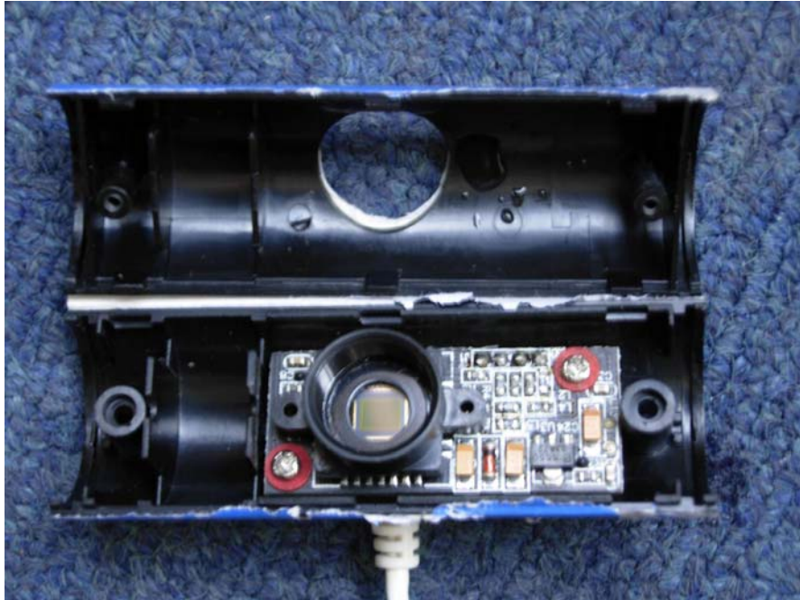
Photo 1- Uncovered View of USBCAM