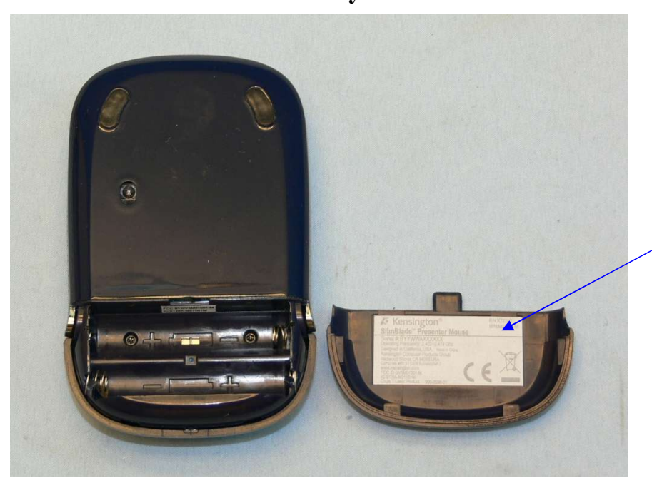
Label 1: in the cover of battery chamber

The label will be permanently affixed at a conspicuous location on the device.