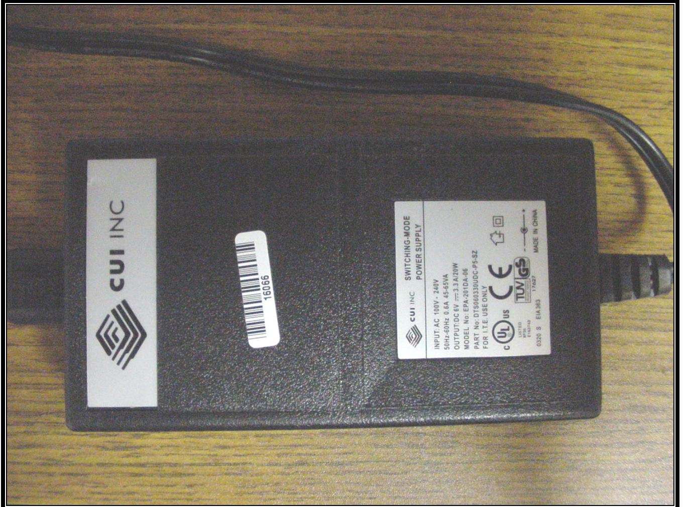
PHOTOGRAPH 14: POWER SUPPLY

Client: Paxar Americas, Inc. FCC: Part 15.247 Industry Canada: RSS-210 FCC ID: GU6WJSX2000A Model: ALR-9932-B