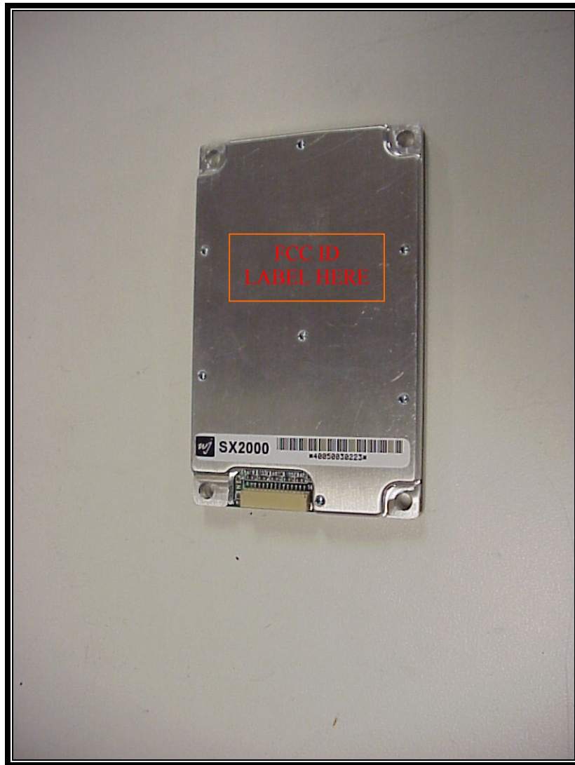
PHOTOGRAPH 1: LABEL LOCATION

Please see the following page for a sample of the FCC Identification Label.