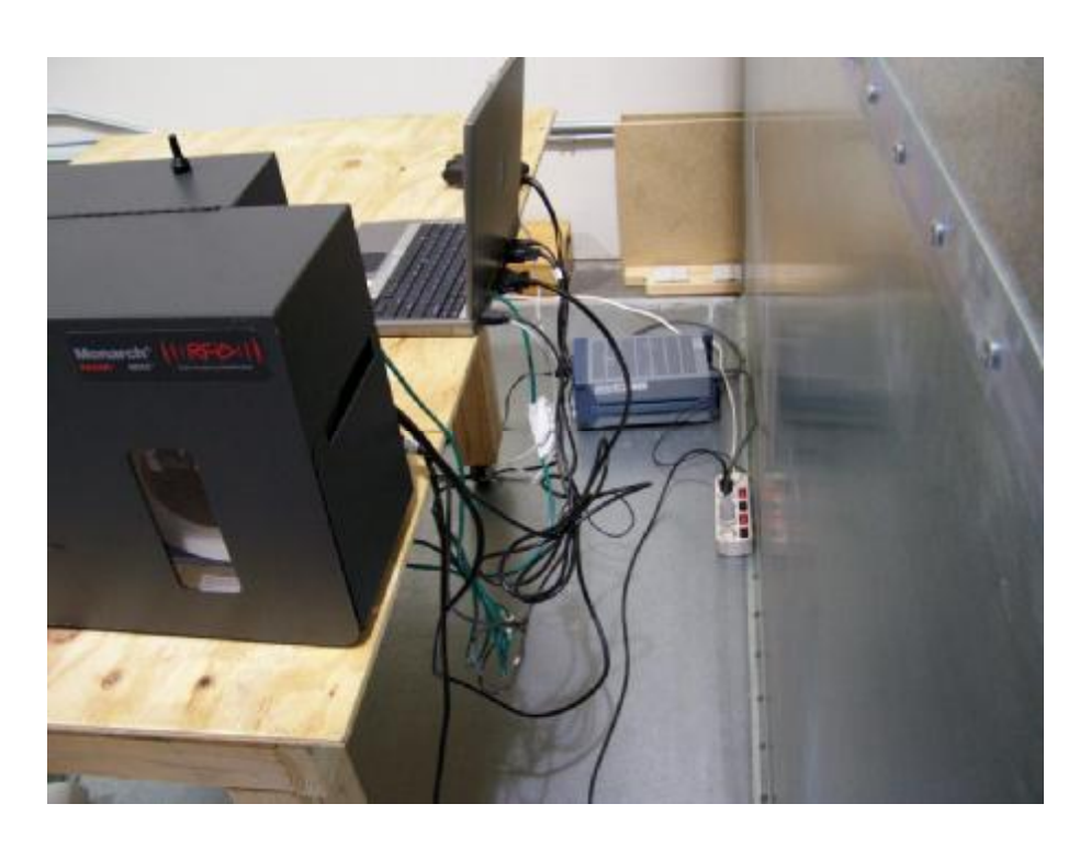
Conducted Emissions Voltage