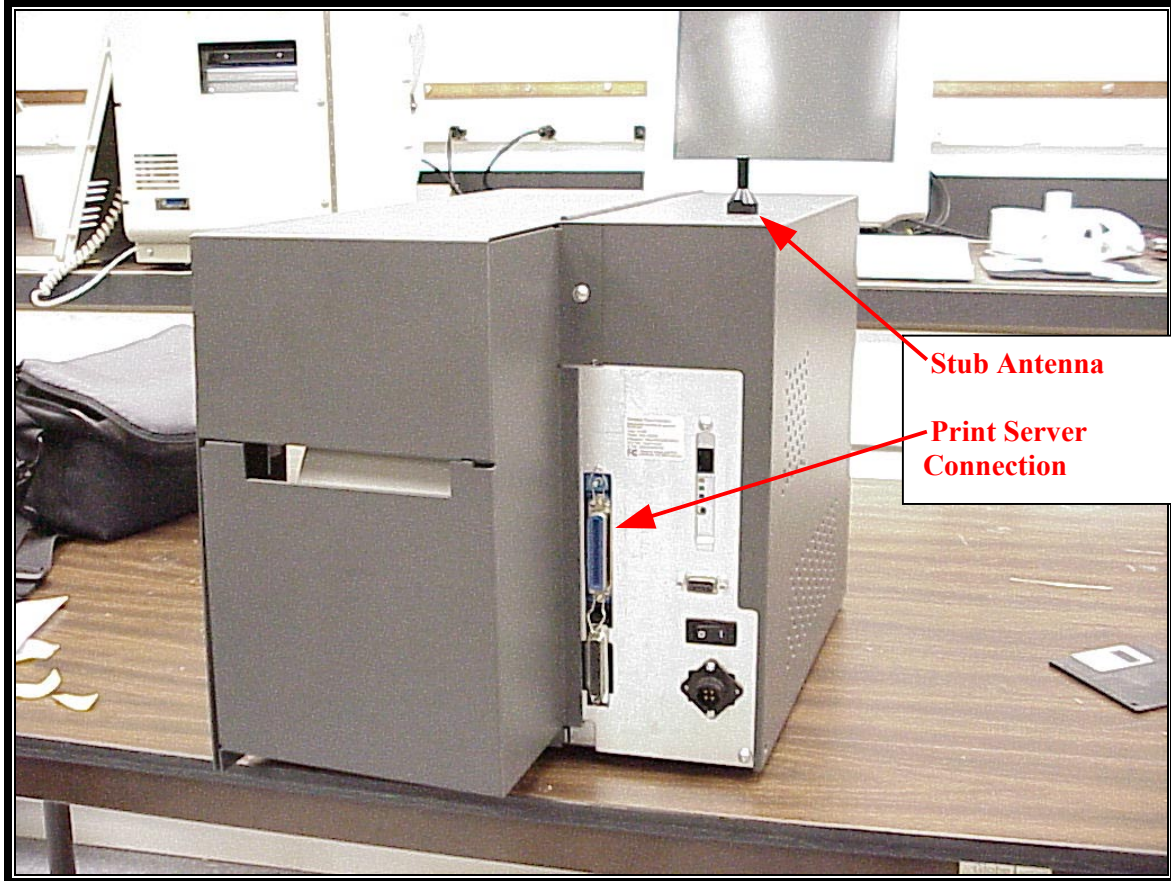
PHOTOGRAPH 17: 98XX SERIES PRINTER WITH METAL HOUSING REAR VIEW