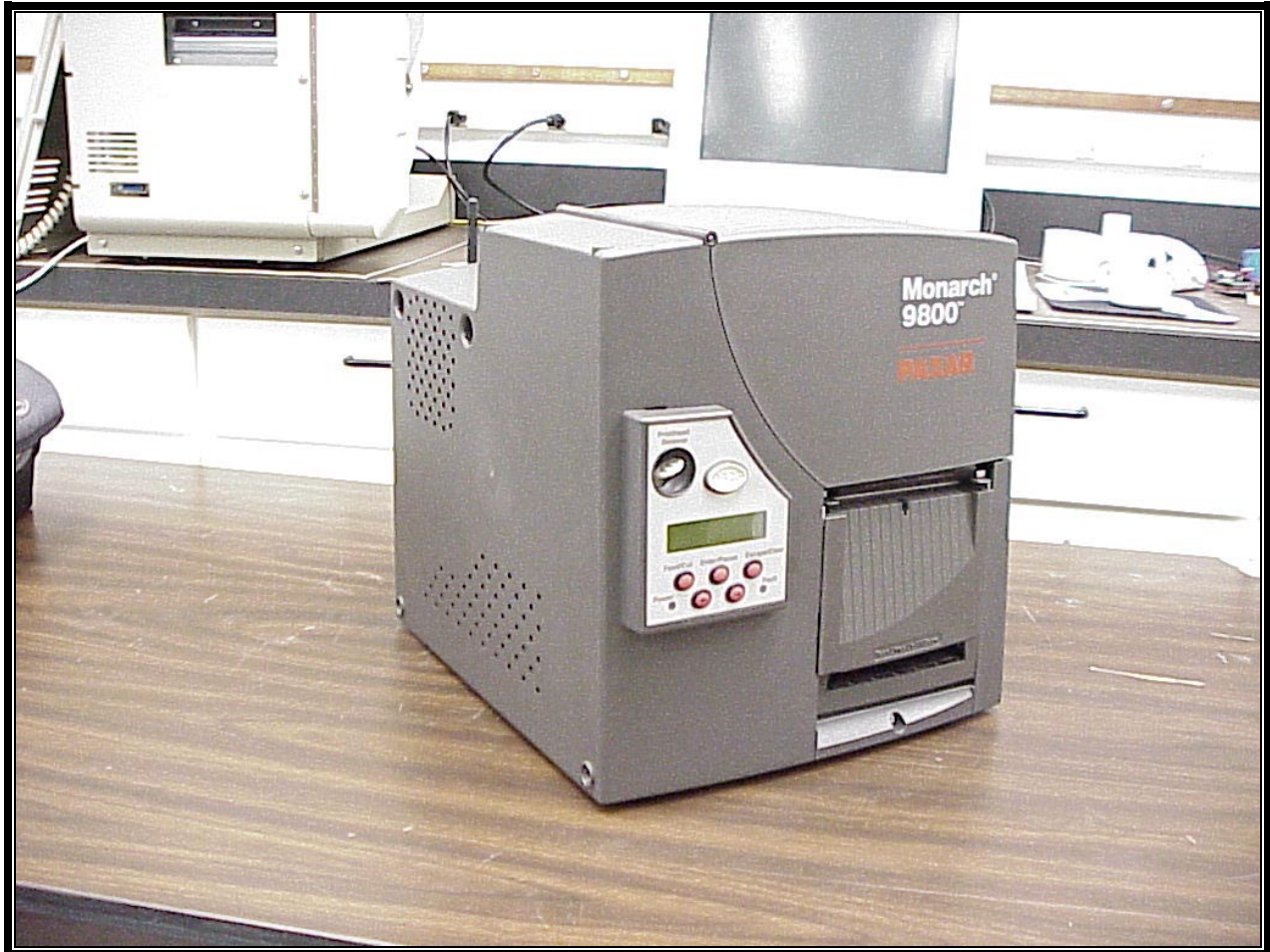
PHOTOGRAPH 14: 98XX SERIES PRINTER WITH PLASTIC HOUSING FRONT VIEW