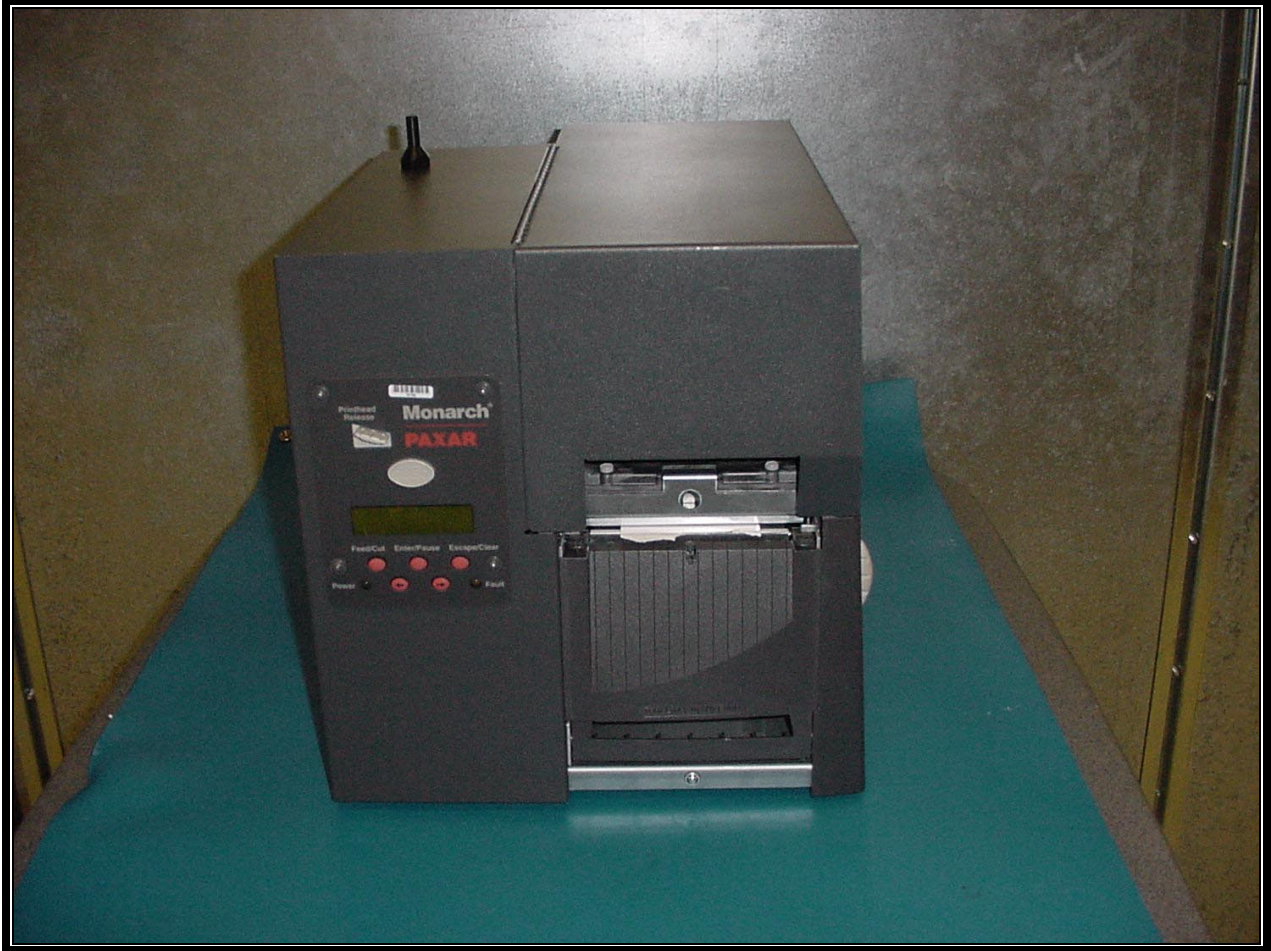
PHOTOGRAPH 16: 98XX SERIES PRINTER WITH METAL HOUSING FRONT VIEW