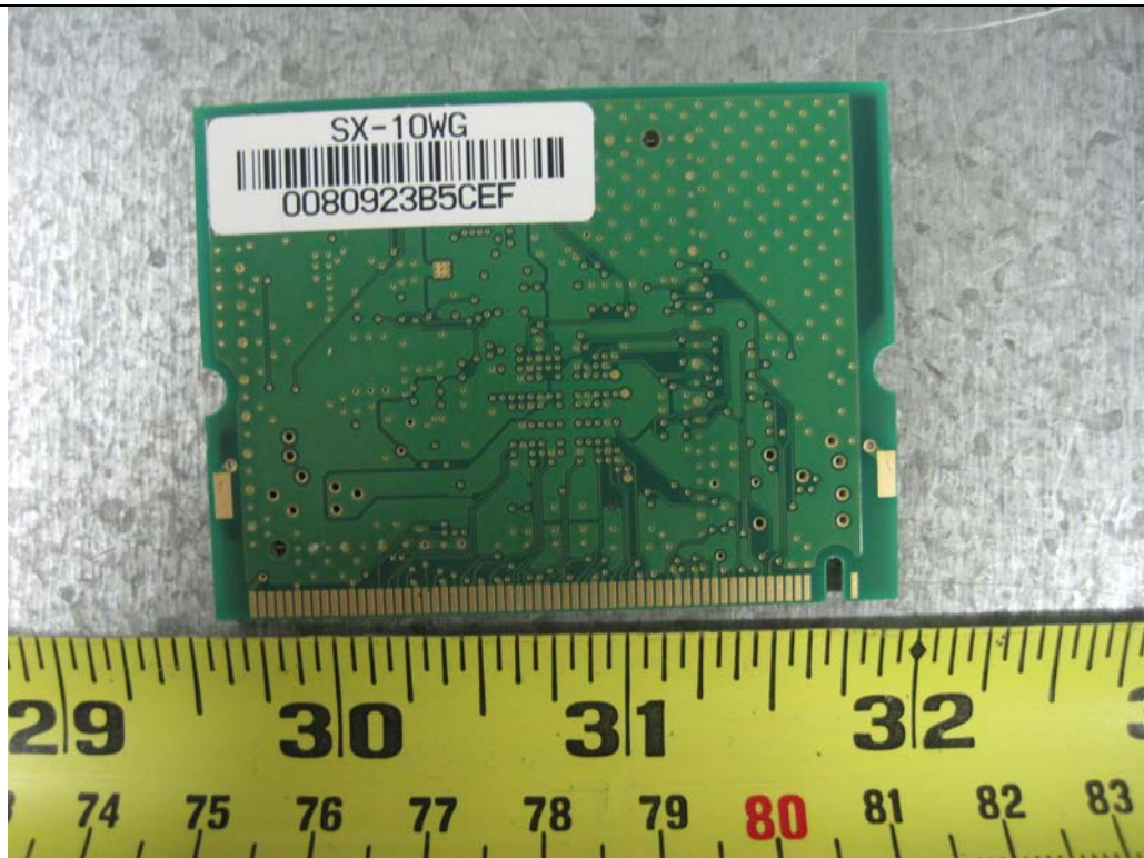
EUT (9906): RF Module PCBA Solder View