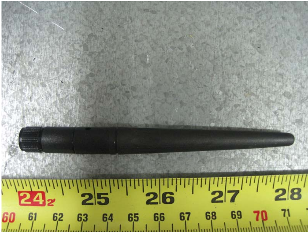
EUT (9906): WLAN Radio External Antenna View 1