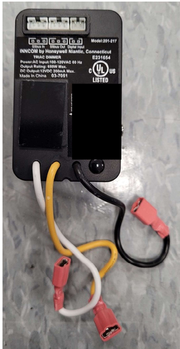
Triac Actuator Back View