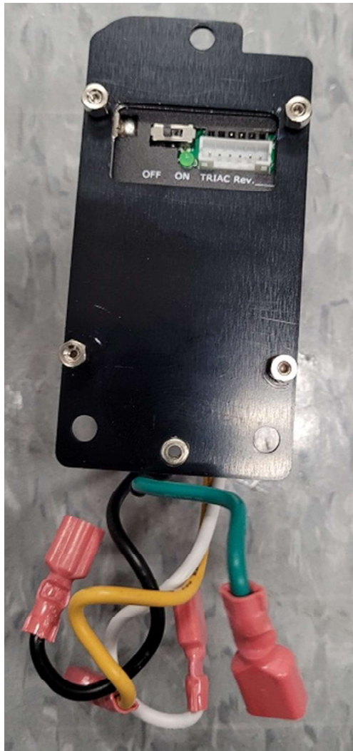
Triac Actuator Front View