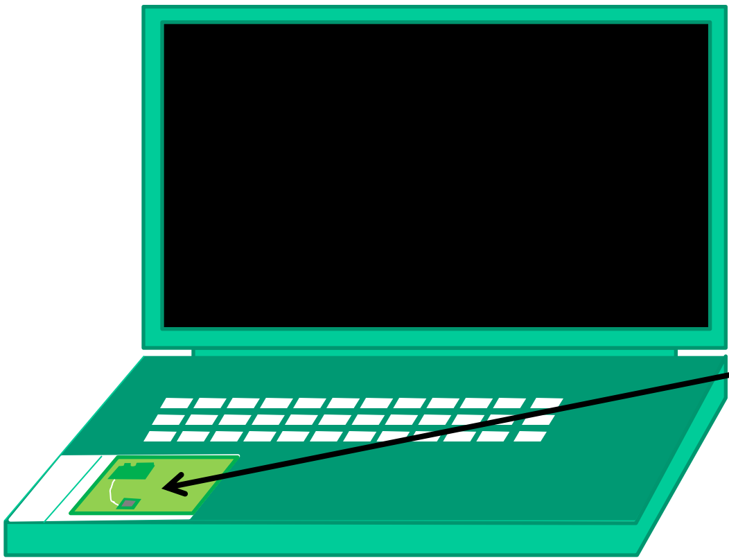
Installation inside PC