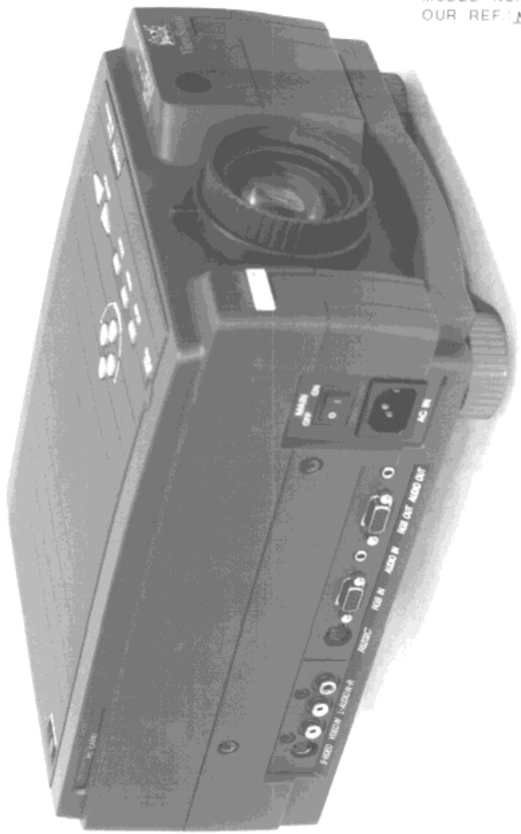
EXHIBIT # _____ FIG NO. _____ FCC ID: GSS99003 MODEL NO. VPRJ21952 OUR REF: MKS98-FO09