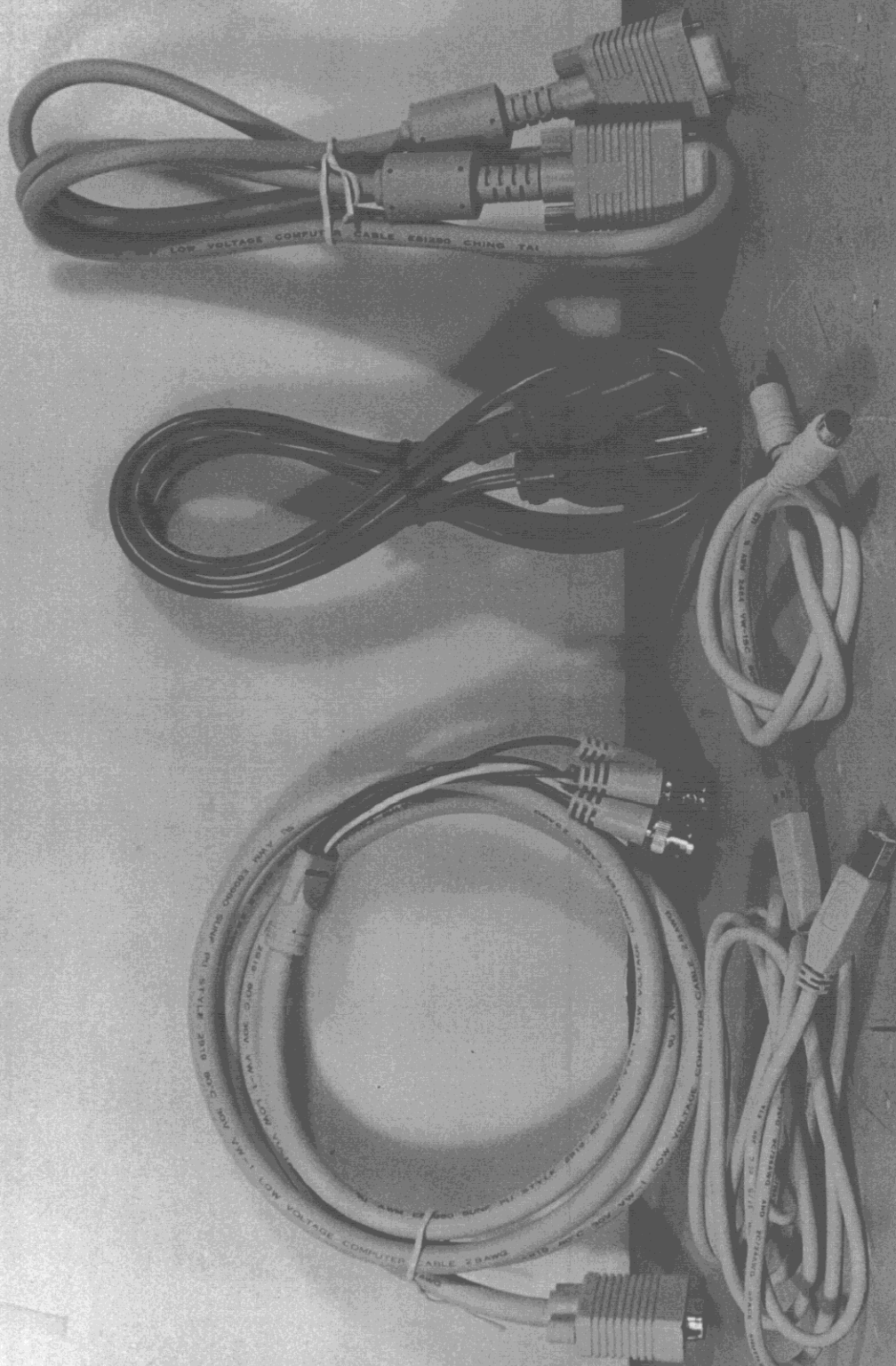
Photo 13. AC Power cord, Signal cable and Hub cable of VCDTS21492-4*

FACTORY CONTROL NO. : FVD-99-F005 FCC ID. : GSS21013