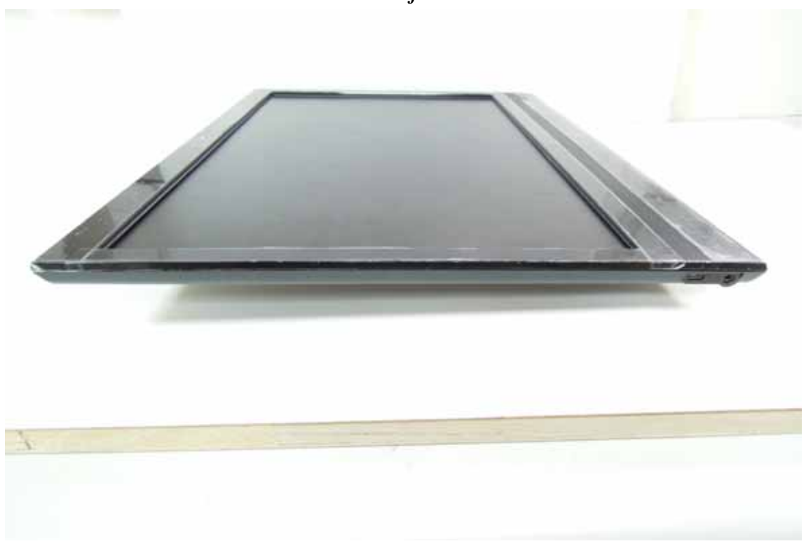
Side View of EUT - 3