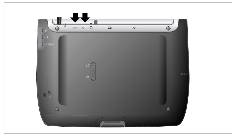
Figure 19: The External Keyboard/Mouse USB Ports

You can attach a USB external keyboard using any one of the two USB ports on the top side of the air panel V110 Wireless Monitor as indicated by the arrow in the figure below (or by using the optional air panel <sup>TM</sup> Dock, shown previously).