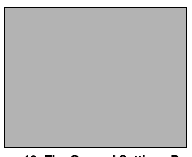
Figure 13: The General Settings Panel

Allows you to alter and control the operator usage environment: