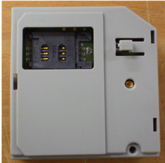
Photograph No.19 GSM module front view