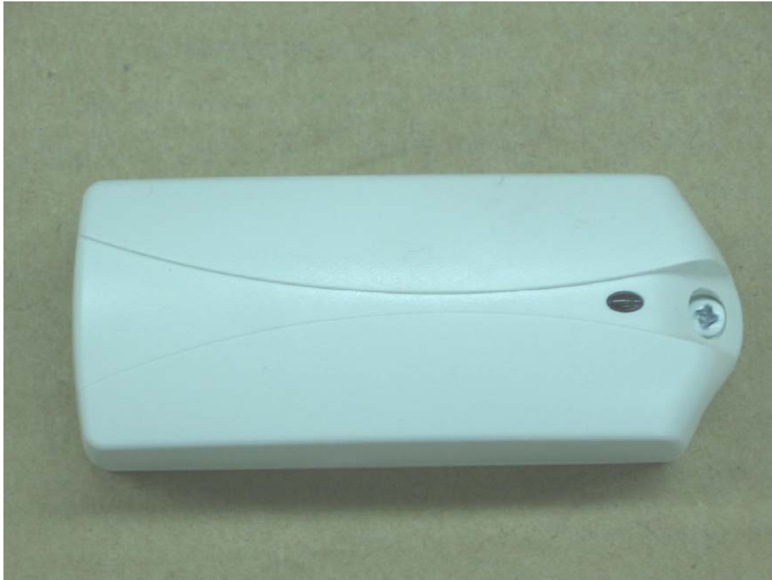
Figure 1: Top Side of Unit