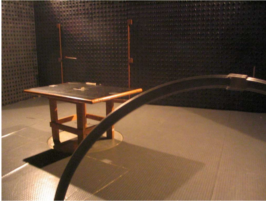
Photograph No.1 Setup for spurious emission field strength measurements in anechoic chamber below 30 MHz