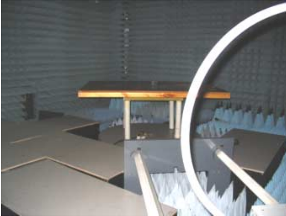
Photograph No.1 Setup for spurious emission field strength measurements in anechoic chamber below 30 MHz