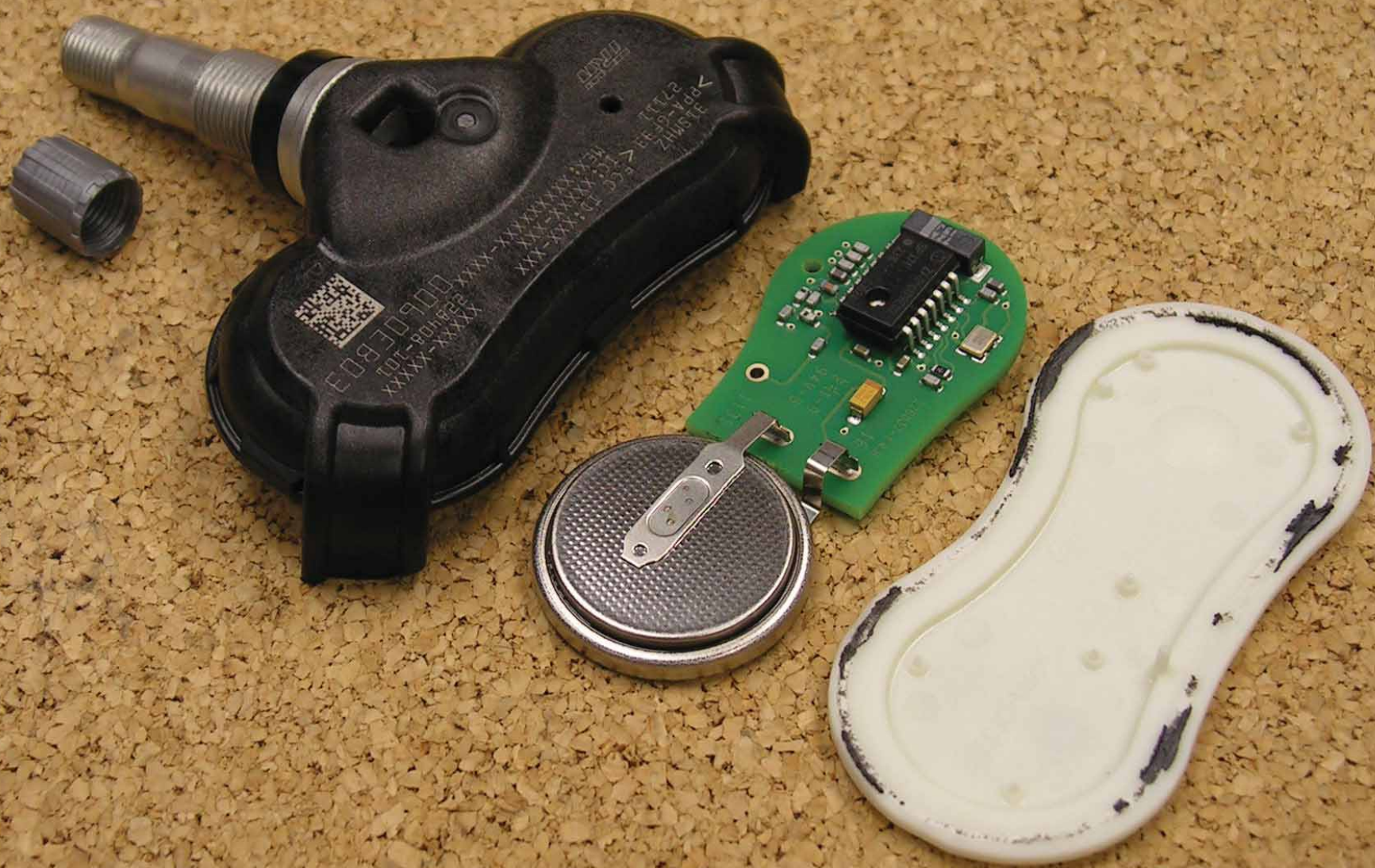
DUT apart (top)