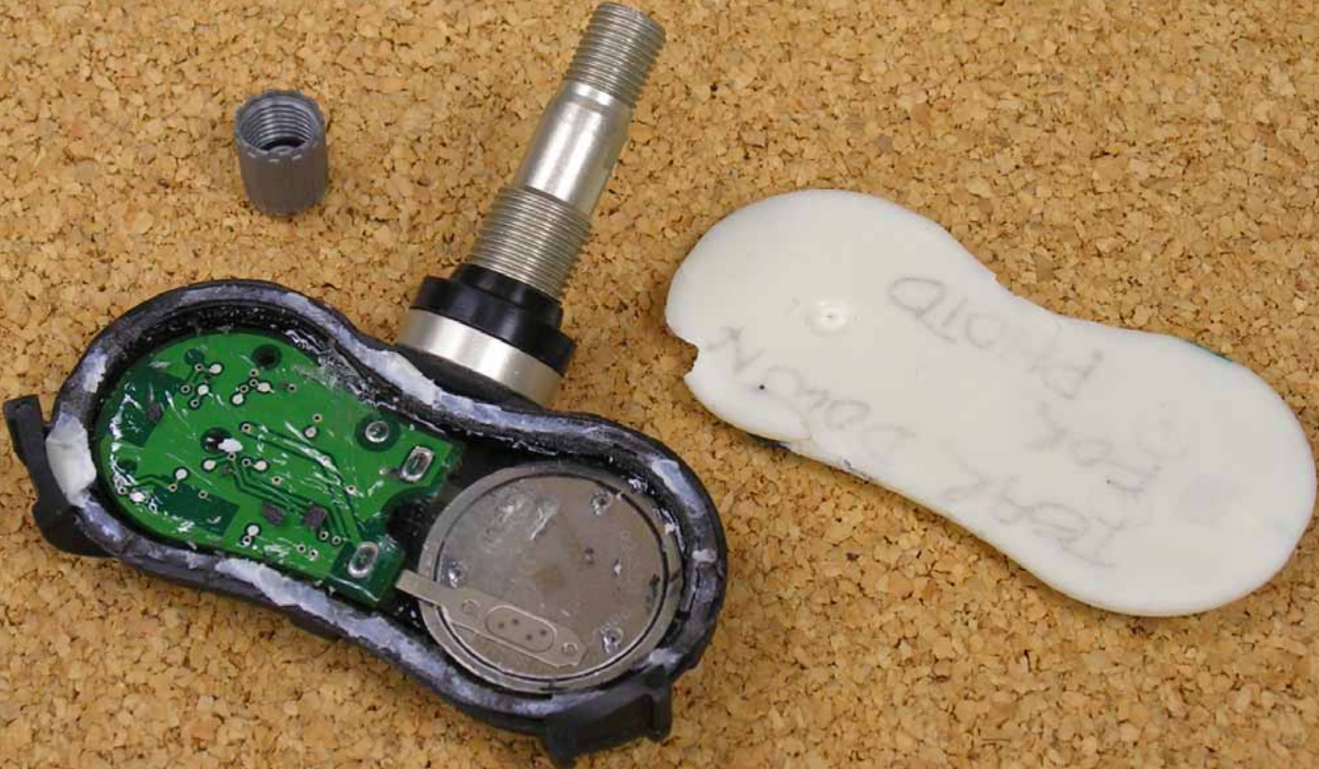
DUT apart (top)