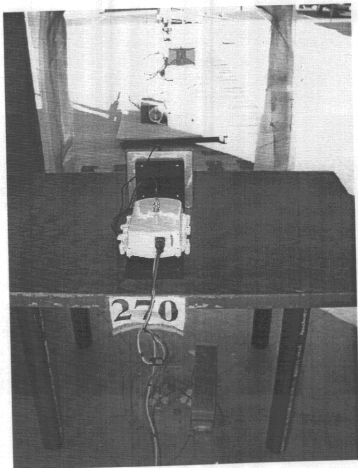
Radiated Emissions in Restricted Bands test setup

Class B Radiated Emissions test setup. (30 - 300 MHz Bi-conical antenna shown. There was no picture taken with the 300 - 1300 MHz Log Periodic antenna that was used later in the test)