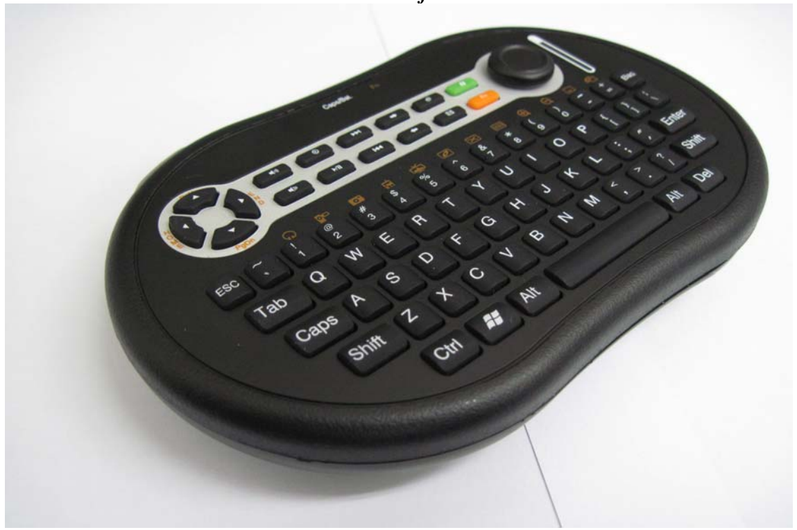
Front View of EUT-2