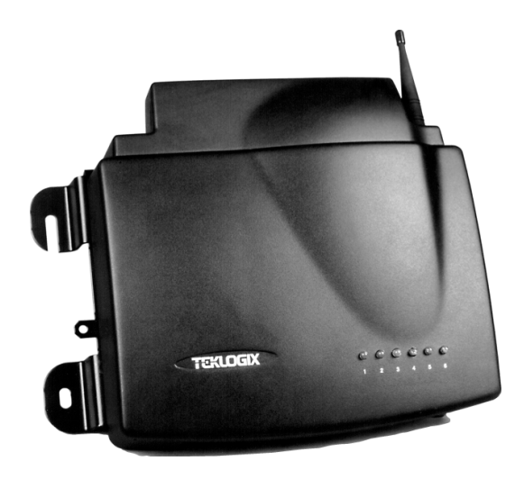
Figure 1.1 The 9150 Wireless Gateway - Front View