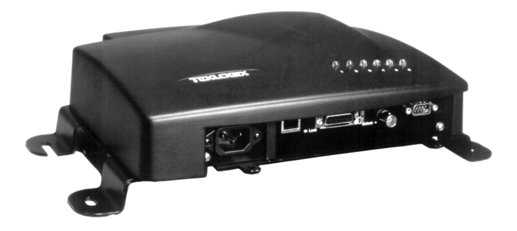
Figure 1.2 The 9150 Wireless Gateway - Bottom View