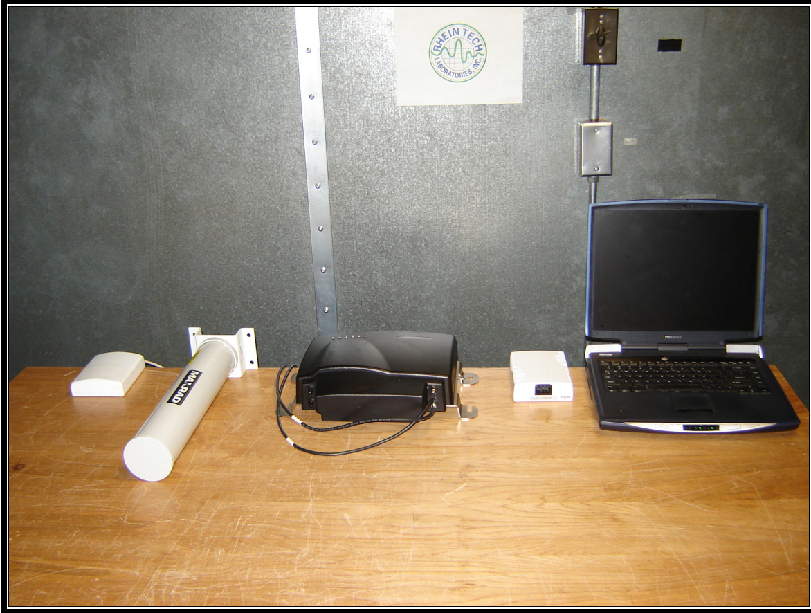
Photograph 7: Conducted Line Emissions Testing; AC Powered - Front View