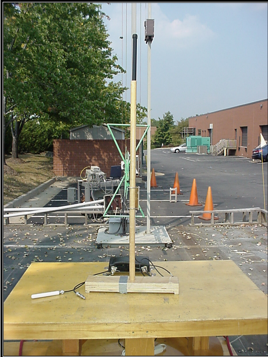
Photograph 4: Radiated Testing – 12 dBi Collinear Omni Rear View