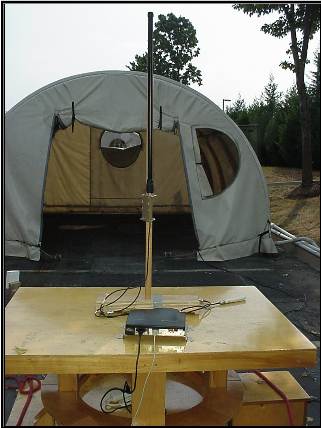
Photograph 3: Radiated Testing – 12 dBi Collinear Omni Front View