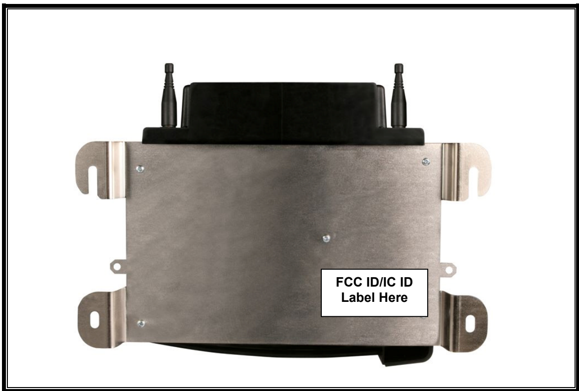
FCC ID/IC ID Label Location