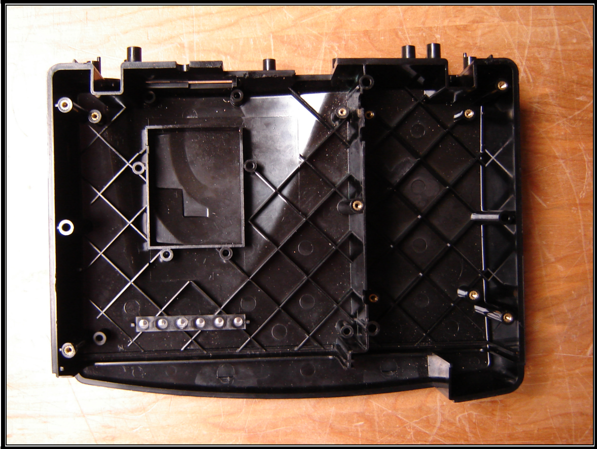
Photograph 19: Inside Bottom View PCB's Removed