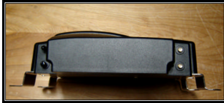
Photograph 24: EUT Rear View