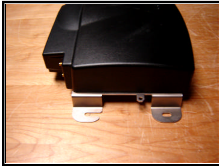
Photograph 26: EUT Left Side View