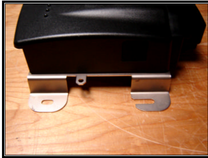
Photograph 27: EUT Right Side View