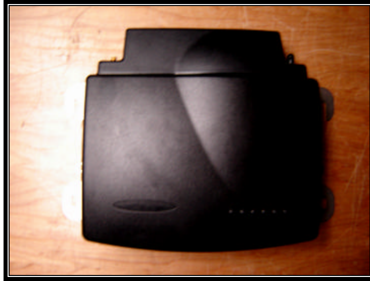
Photograph 25: EUT Top View