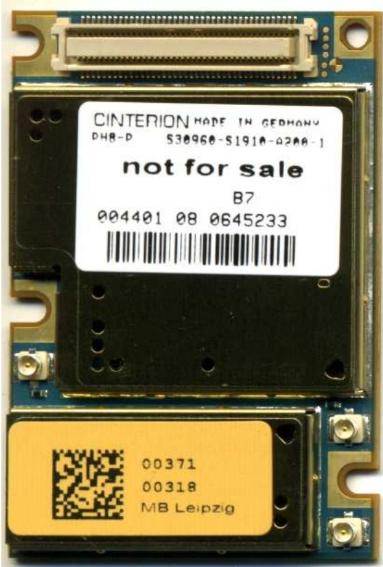
PH8-P Top side