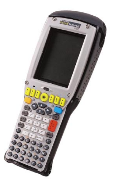
Figure 1.1 The 7535 G2 Hand-Held Computer