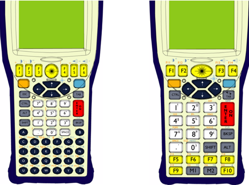
Figure 2.1 58-Key Keyboard (left) And 37-Key Keyboard

The 7535 G2 has two types of available keyboard layouts. One type has 58 keys; the other has 37 keys.