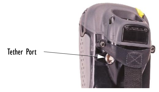
Figure 1.4 The Tether Port

The tether port allows an external non-decoded scanner, a serial scanner, or a USB client device to be connected to the terminal through a single connector. Generic serial devices, such as printers, GPS receivers, and other serial devices, are also supported.