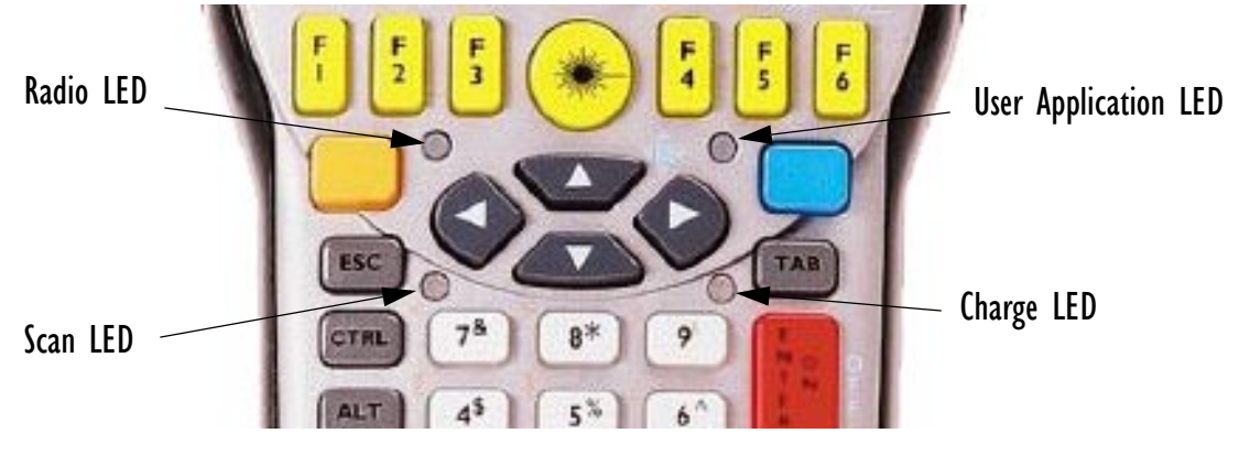
Figure 2.2 Indicator LEDs

The 7535 G2 has four tri-coloured indicator LEDs.