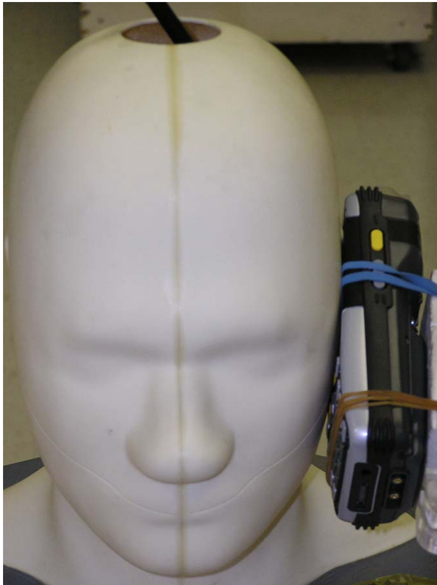
Photo 1. Left Touch