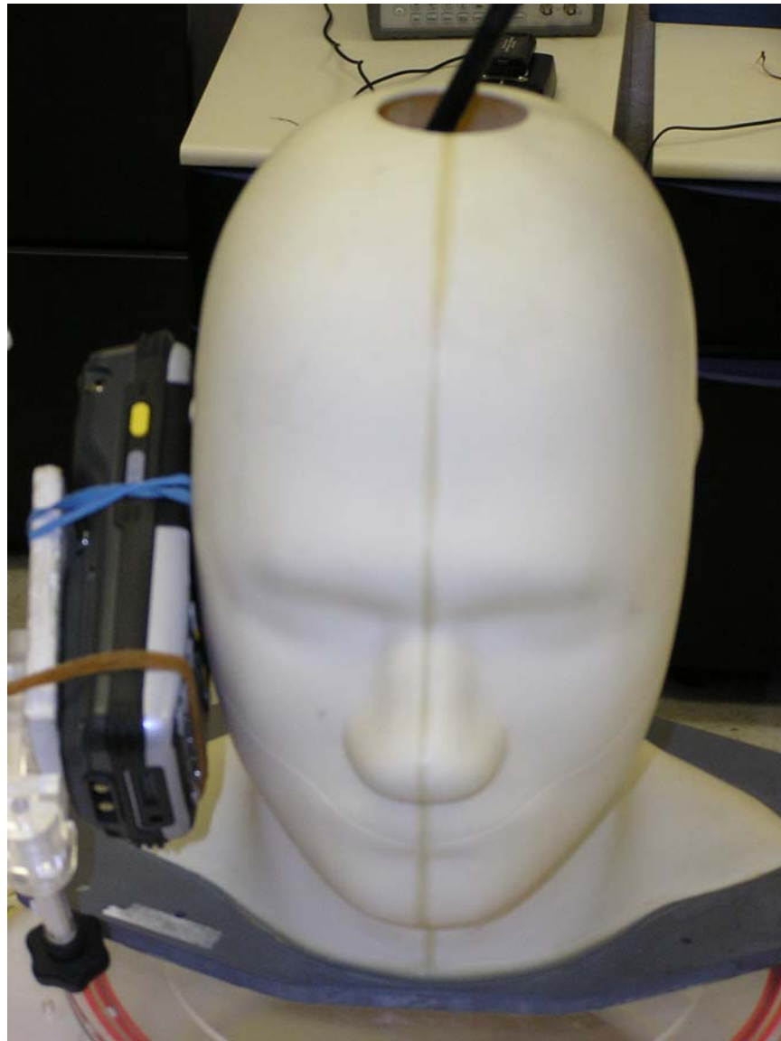
Photo 3. Right Touch