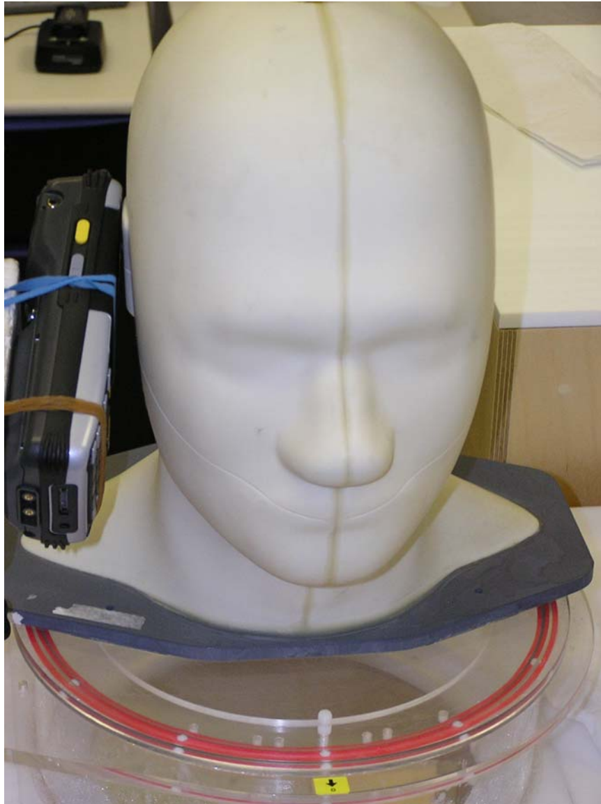
Photo 4. Right Tilt