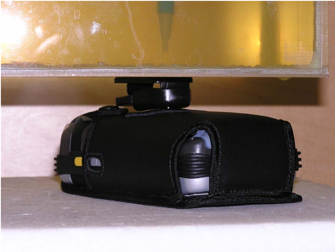
Photo 5. Body Touch