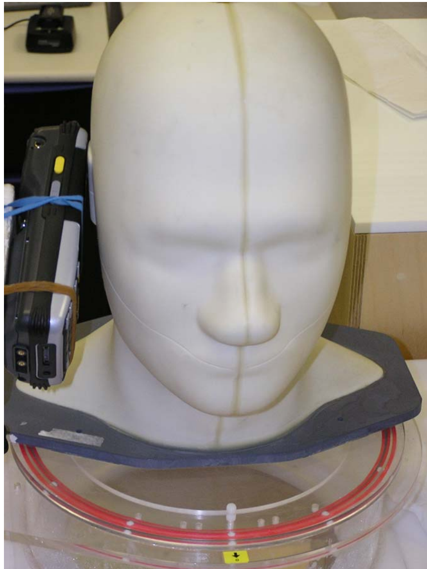
Photo 4. Right Tilt