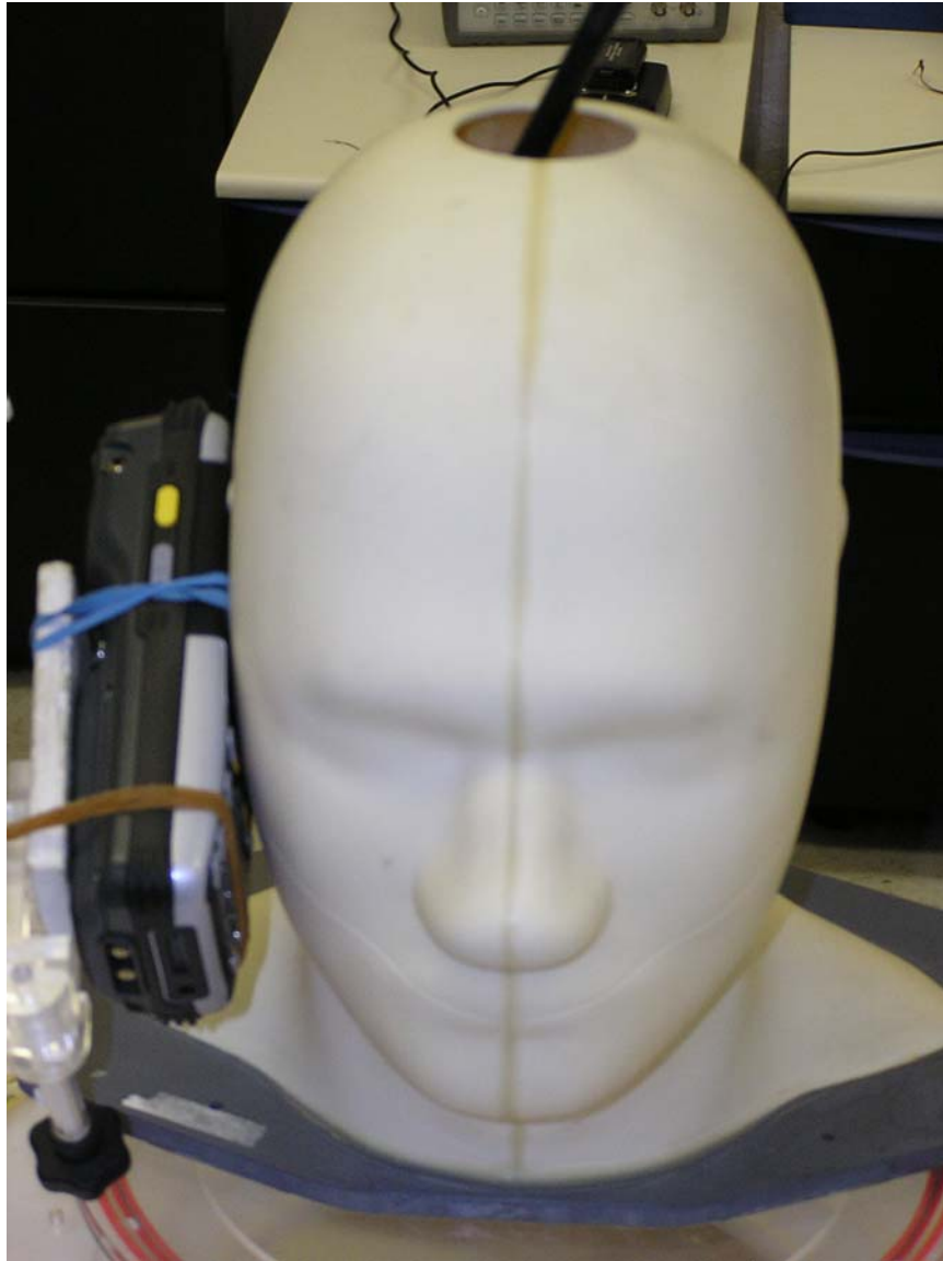
Photo 3. Right Touch