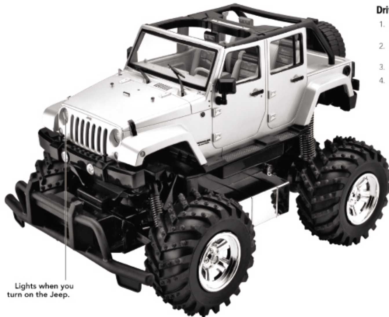
Lights when you turn on the Jeep.

Registered trademark licensed to ITA and used with the permission of TRS Quality Inc.