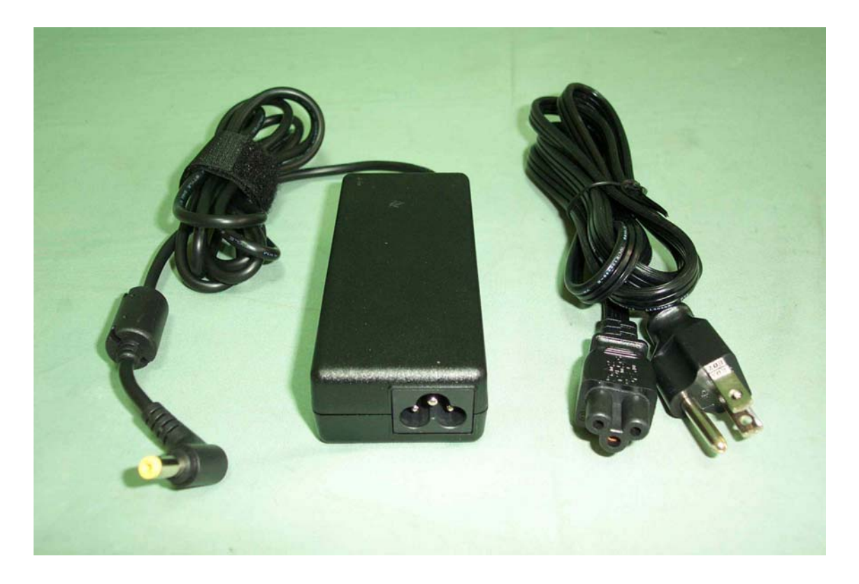
Back View of Power Adapter