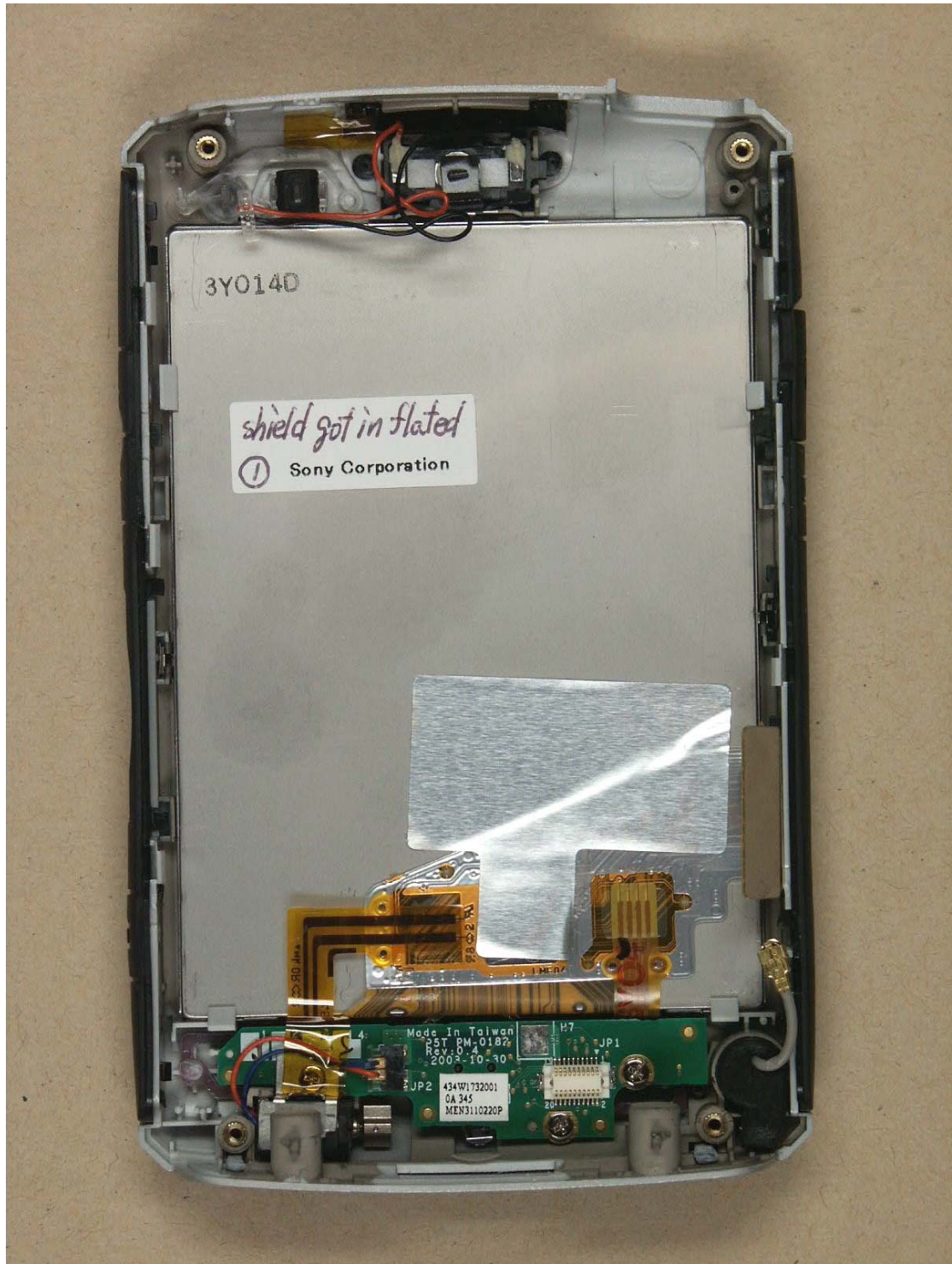
Main Board Top