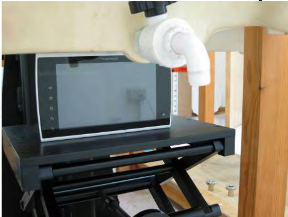
Fig.5 Configuration 4: Primary Landscape mode

Unless otherwise stated the results shown in this test report refer only to the sample(s) tested and such sample(s) are retained for 90 days only. 除非另有說明，此報告結果僅對測試之樣品負責，同時此樣品僅保留 90 天。本報告未經本公司書面許可，不可部份複製。