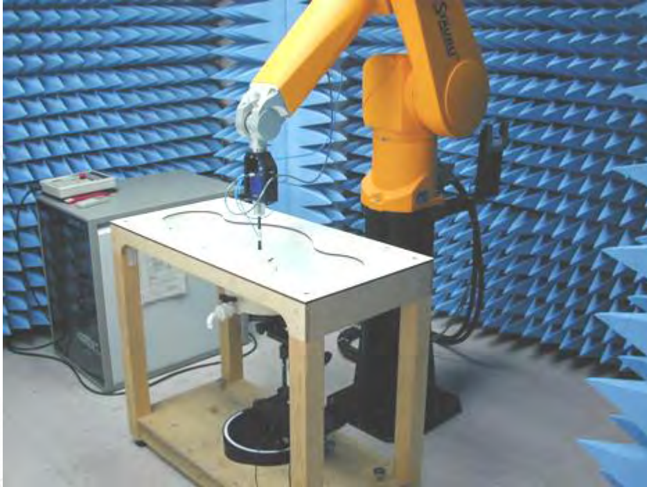
Fig.1 Photograph of the SAR measurement System