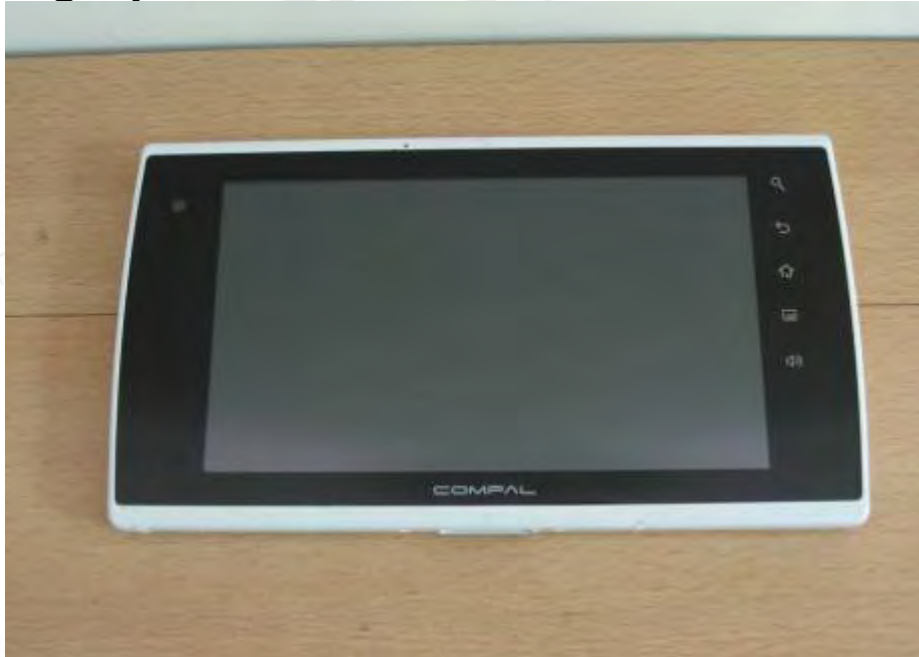
Fig.6 Front view of EUT