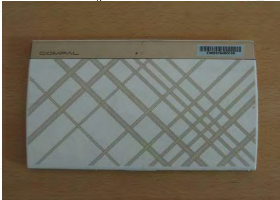
Fig.7 Back view of EUT