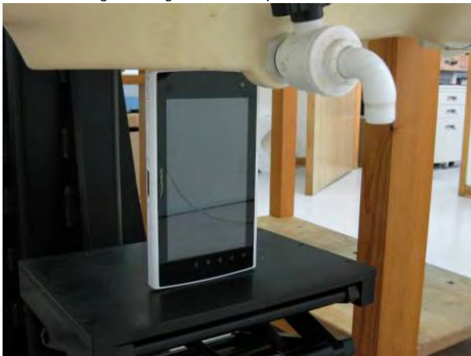
Fig.4 Configuration 2: Primary portrait mode.

Unless otherwise stated the results shown in this test report refer only to the sample(s) tested and such sample(s) are retained for 90 days only. 除非另有說明，此報告結果僅對測試之樣品負責，同時此樣品僅保留 90 天。本報告未經本公司書面許可，不可部份複製。