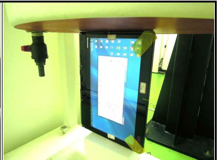
Left Side of EUT with 0 cm Gap