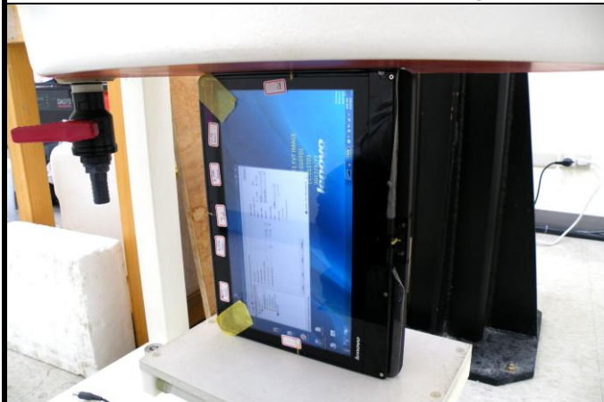
Right Side of EUT with 0 cm Gap