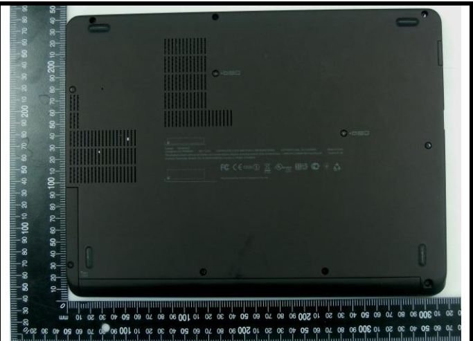
EUT – Bottom View