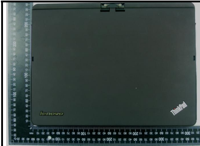
EUT – Top View