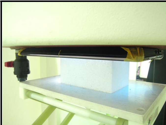
Rear Face of EUT with 0 cm Gap