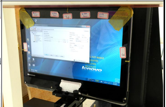
Top Side of EUT with 0 cm Gap