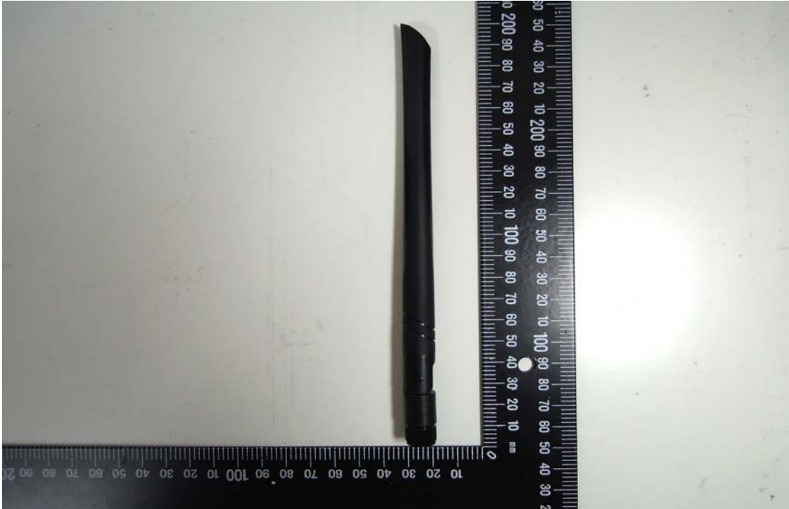
Bottom View of Antenna