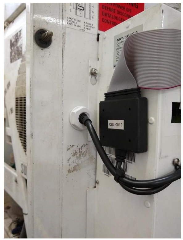
Figure 3: Ribbon Harness