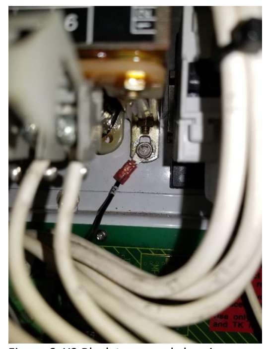
Figure 6: X2 Black to ground chassis