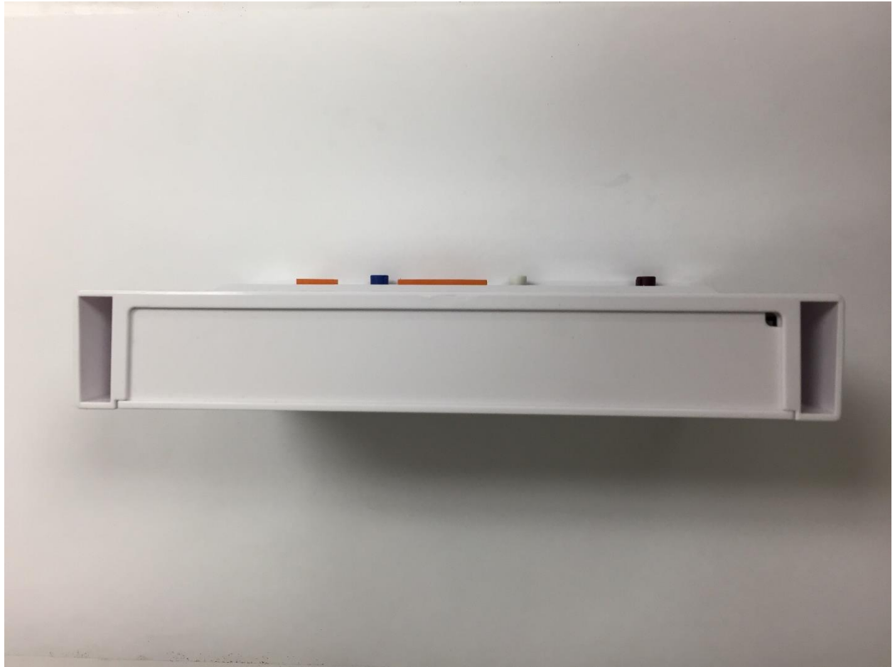
External Side 2