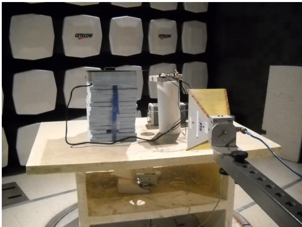
Fig. 4 Radiated Emissions 1-18GHz