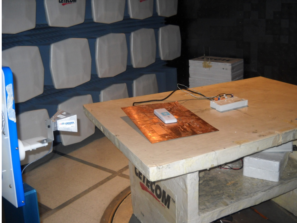
Fig.7 Radiated Emissions >18GHz