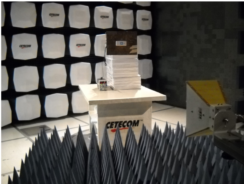
Fig. 2 ERP/EIRP Test Setup