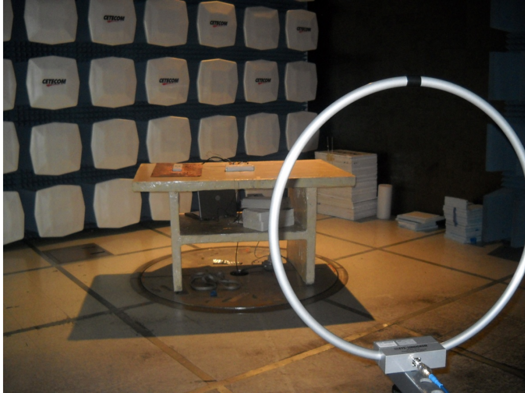
Fig. 5 Field Strength Measurements <30 MHz