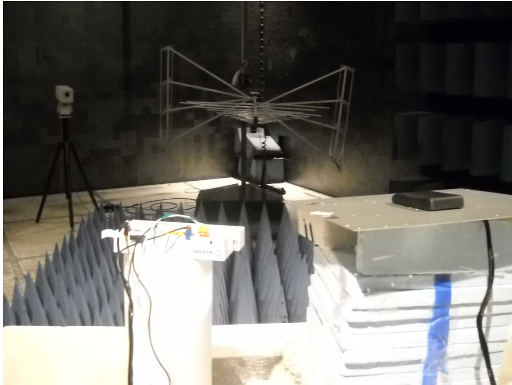
Fig. 3 Radiated Emissions: 30M- 1GHz