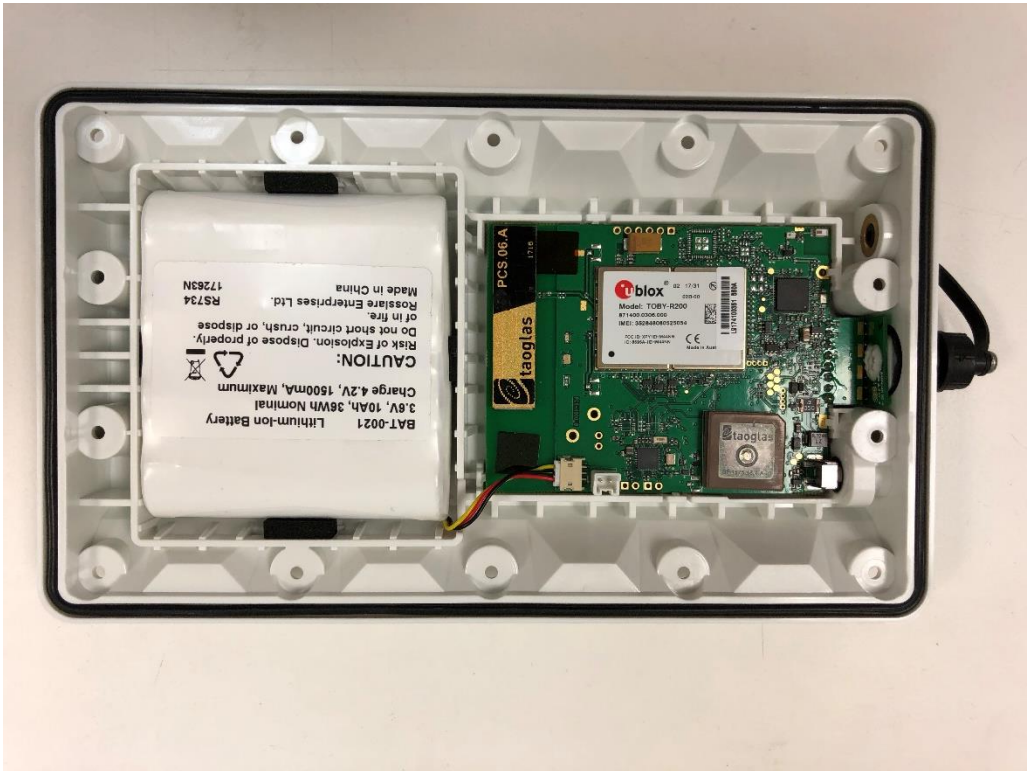
PCB as installed in housing