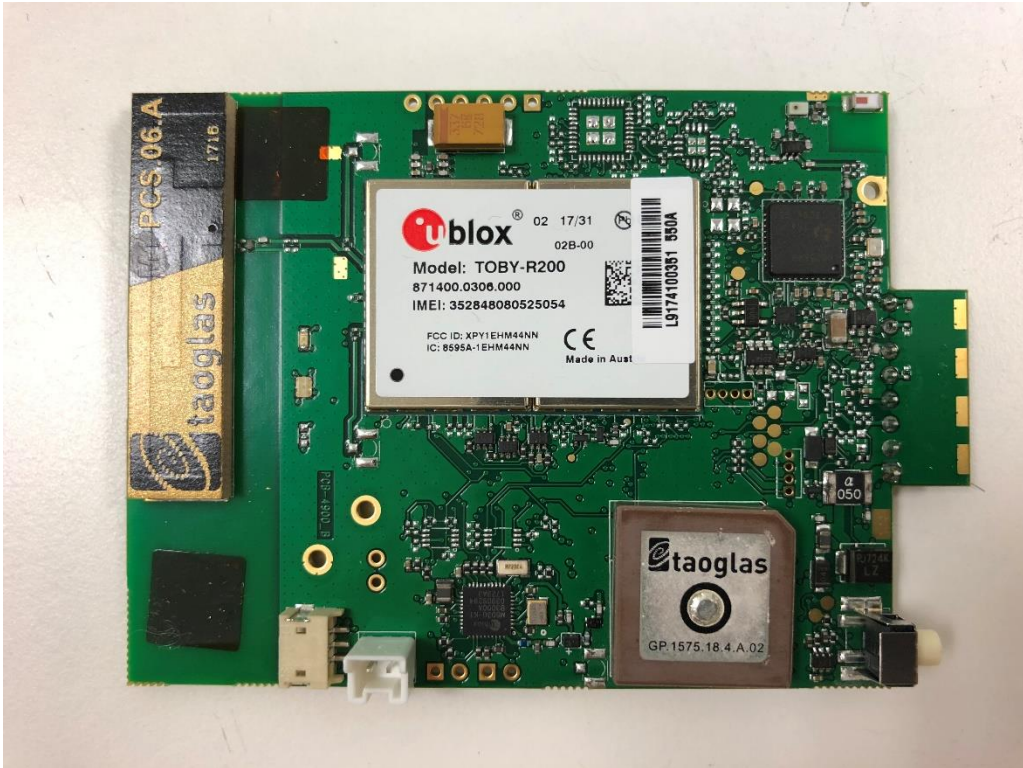
PCB top view